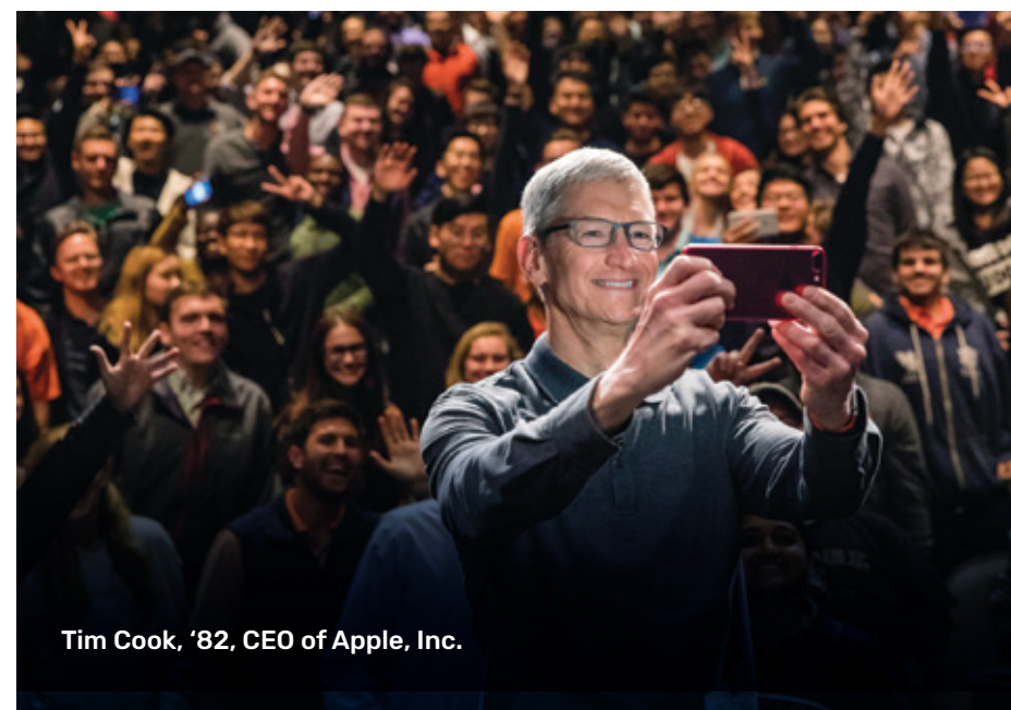
Tim Cook, '82, CEO of Apple, Inc.

Walk the gorgeous campus with friends, picnic in the Davis Arboretum (a 13.5-acre nature preserve on campus), or gather your books for an outdoor study session.